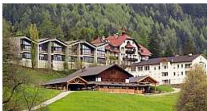
Fachschule für Land- und Hauswirtschaft